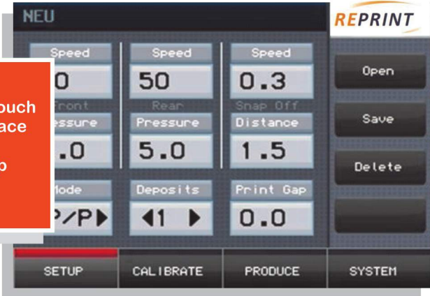
Easy to use touch screen interface showing the product setup menu.