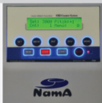
Simple Operation Keys