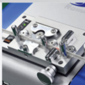
Easy adjustment for detection sensor 8,12,16,24~48mm