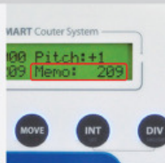
Memory for counting Q'ty