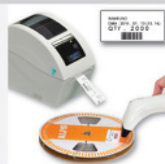
Barcode Printer & Scanner