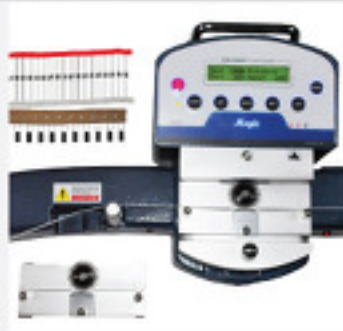
3 in 1 Counting system (SMD, Axial, Radial)