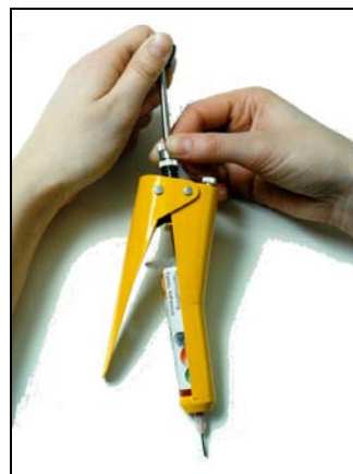
adjusting of the backside suction intensity