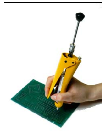
proper way of dispensing