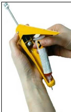
inserting of new cartridge

•stand for 2 dispensers •set of stainless needles 0.7, 0.9 and 1.2 mm •set of plastic needles 0.7, 0.9 and 1.2 mm •spare piston 1pc